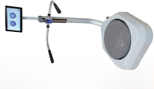
Balance System™ SD

Be the Provider of Choice for this growing population... with Biodesx. 1-800-224-6339 | Int'l: +1-631-924-9000 | info@biodesx.com