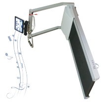
Gait Trainer™ 3