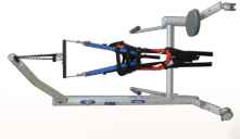
NoStep™ Unweighing System