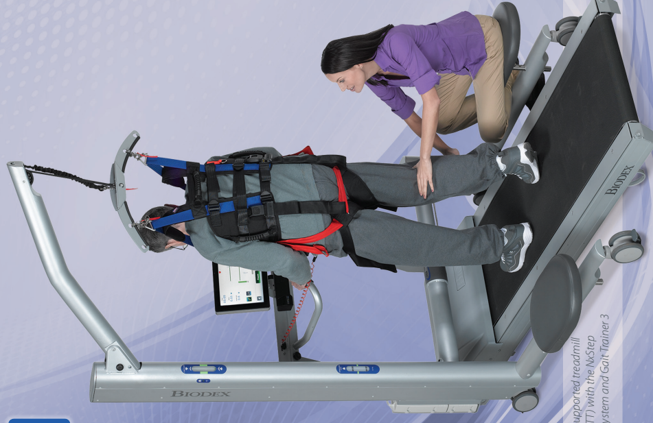
Body weight-supported treadmill training (BWSTT) with the NxStep Unweighing System and Gait Trainer 3