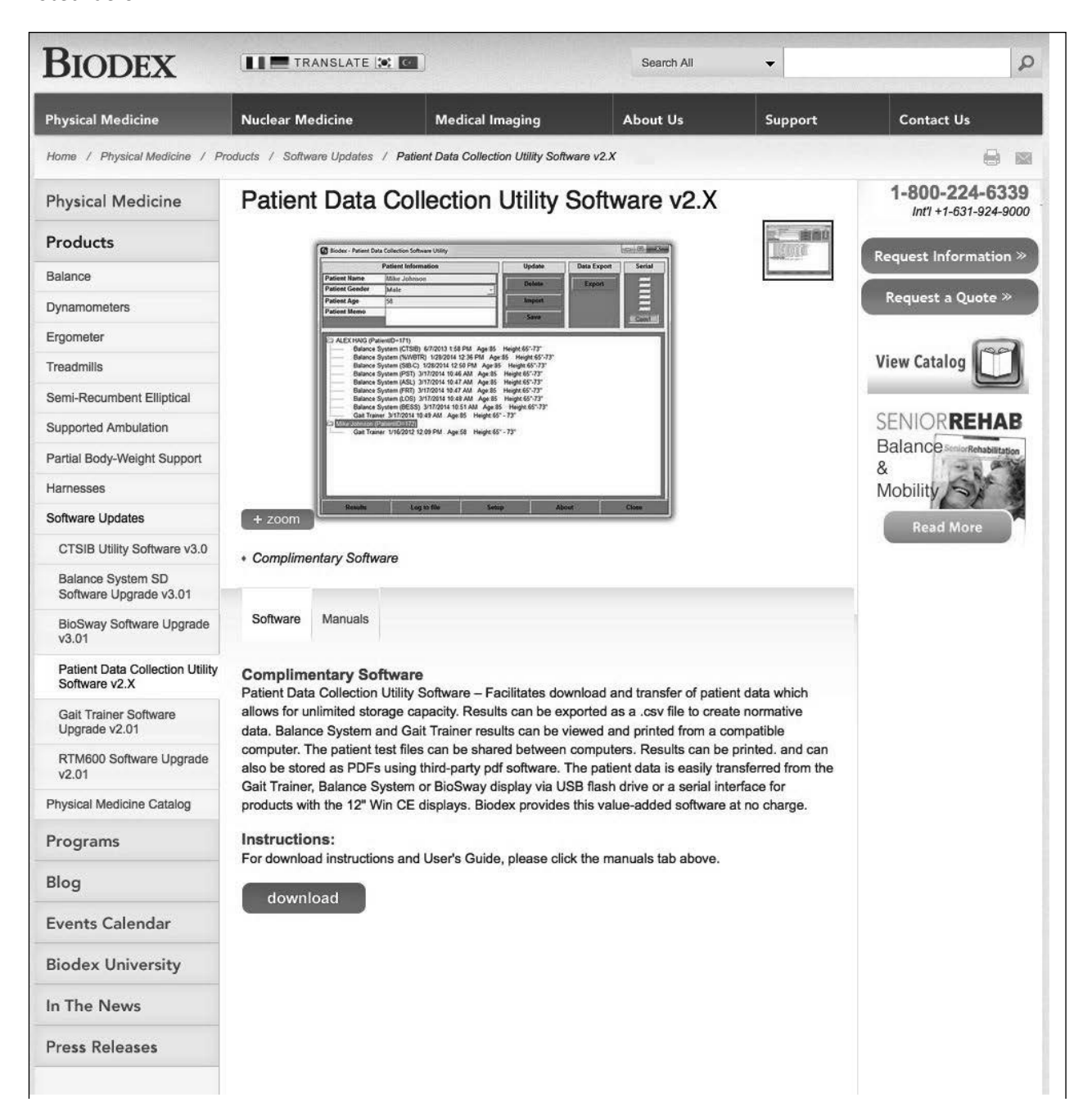
Figure 1. Patient Data Collection Software Download screen

On the Biodex web site, Physical Medicine section, navigate to the 'Software Updates' page under 'Products' in the left navigation bar, and select Patient Data Collection v2.X Software. (This document uses '2.X' to refer to the latest version of the software, but the website will show the actual latest version number; for example, in April 2016, version 2.0.2 was released.) This will bring up the page with a "download" button (See Figures 1 and 2). Follow the steps listed below: