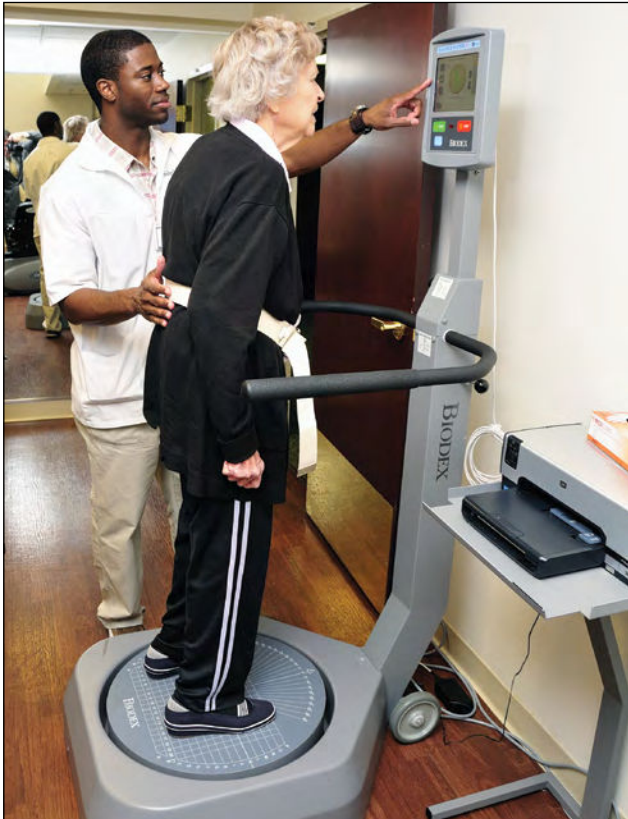
The Biodex Balance System SD improves weight-shifting capabilities in all axes.