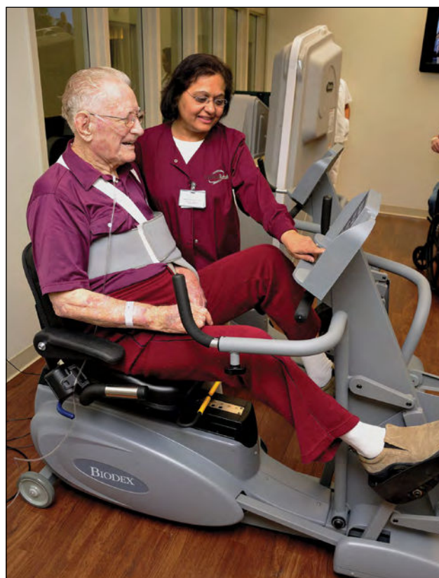
The Biodex BioStep is good for both endurance and lower extremity strengthening.

After hip or knee surgery, most surgeons want their patients to put as much weight on the operated limb as the patient can tolerate. The right kind of stress actually enhances bone healing. Without guided rehabilitation, many patients – perhaps, most – favor their un-operated leg. If they would walk like that for perhaps six to eight weeks until the pain subsided, they would develop bad gait patterns. Months later, such people are still displaying a short step length, which can increase their risk of a fall. And when they have to walk long distances, they're limping.