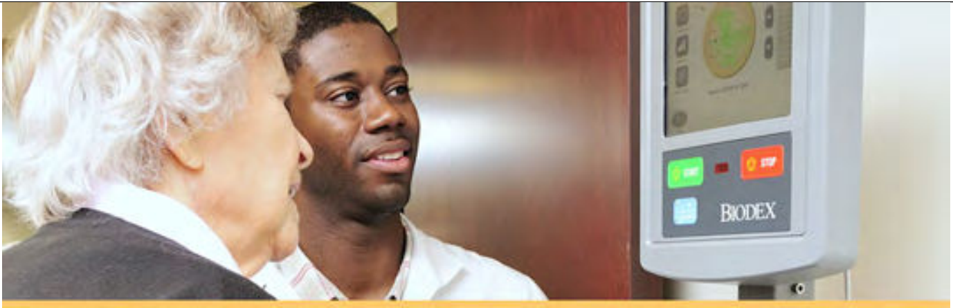
A UHS Pruitt therapist uses the visual feedback on the Balance System to help his client understand her abilities. Printouts are used to track progress toward a goal.