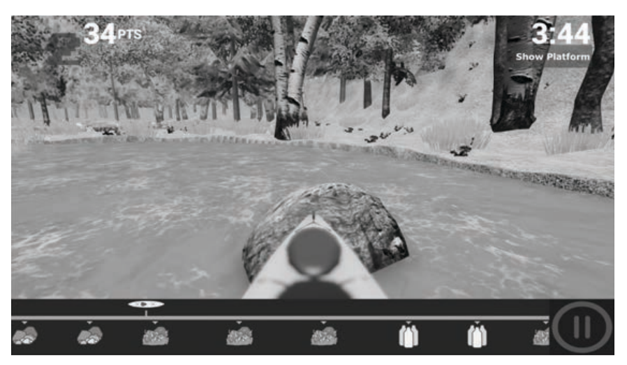
Figure 13. Game Screen Displaying Deducted Points.

• Aim for water bottles. Collecting water bottles earns extra points. The points will appear in green on the screen.