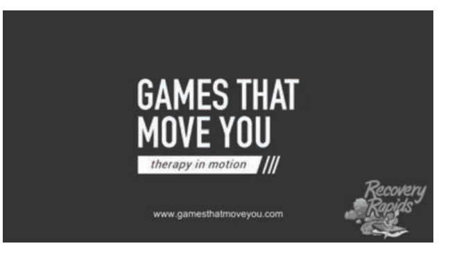
Figure 8. Games That Move You Screen.

• Touch <Recovery Rapids>. The Games That Move You screen displays as the game loads.