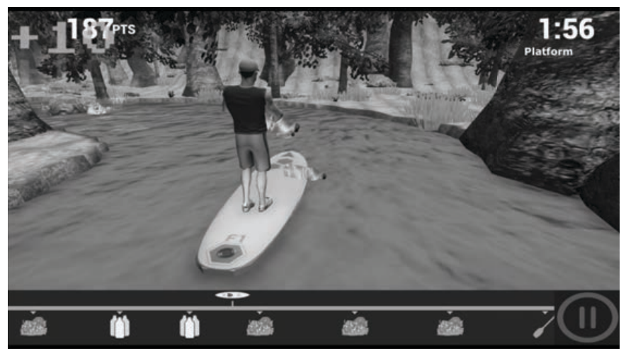
Figure 14. Points for Collecting Water Bottles are Displayed in the Upper Left of the Screen.

• Aim for water bottles. Collecting water bottles earns extra points. The points will appear in green on the screen.