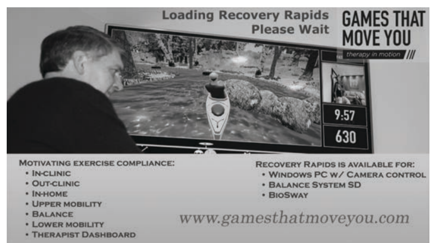
Figure 11. Games That Move You Home Screen.

The Games That Move You screen displays as your game loads.