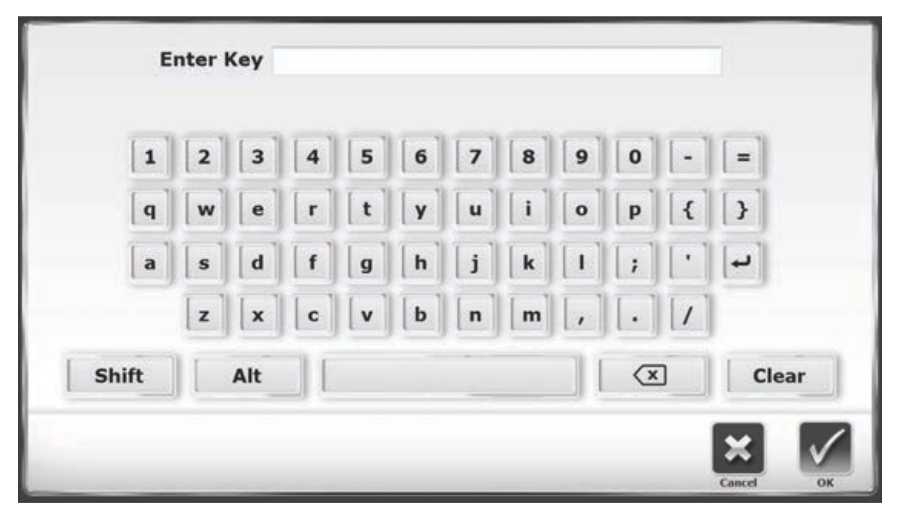
Figure 4. Keyboard for Recovery Rapids Screen

3. Touch <Key> to display a keyboard on which the key can be entered.