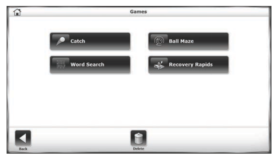
Figure 2. Games Main Menu.

1. From the Games screen, touch <Recovery Rapids>.