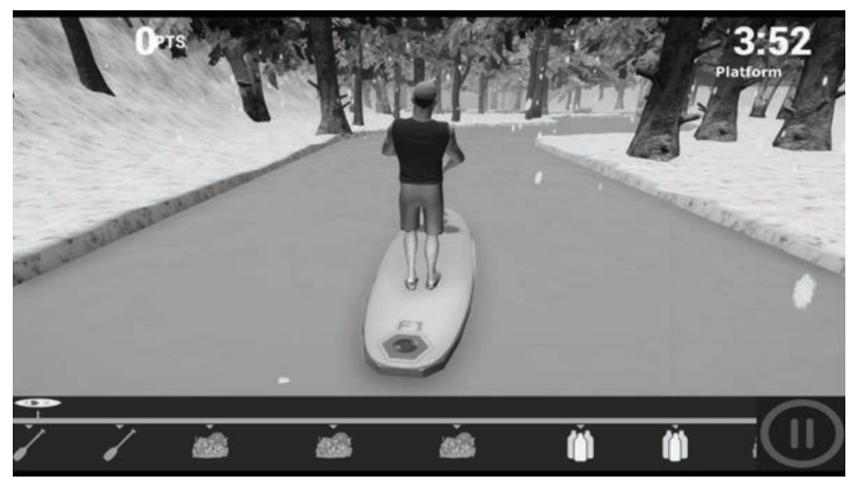
Figure 12. Winter Theme on a Paddle Board.