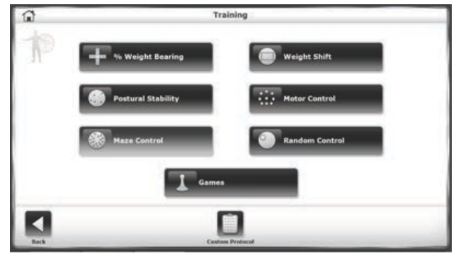
Figure 7. Training Screen.