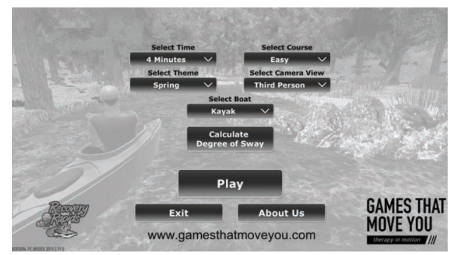
Figure 9. Recovery Rapids Home Screen.