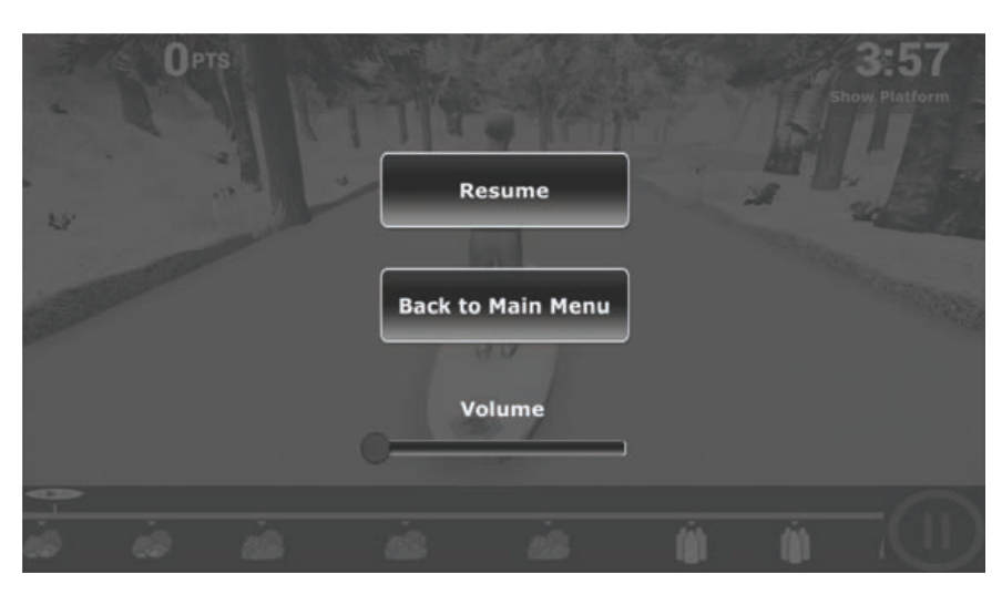
Figure 15. Screen Displaying <RESUME>, <BACK TO MAIN MENU>, and <VOLUME>.