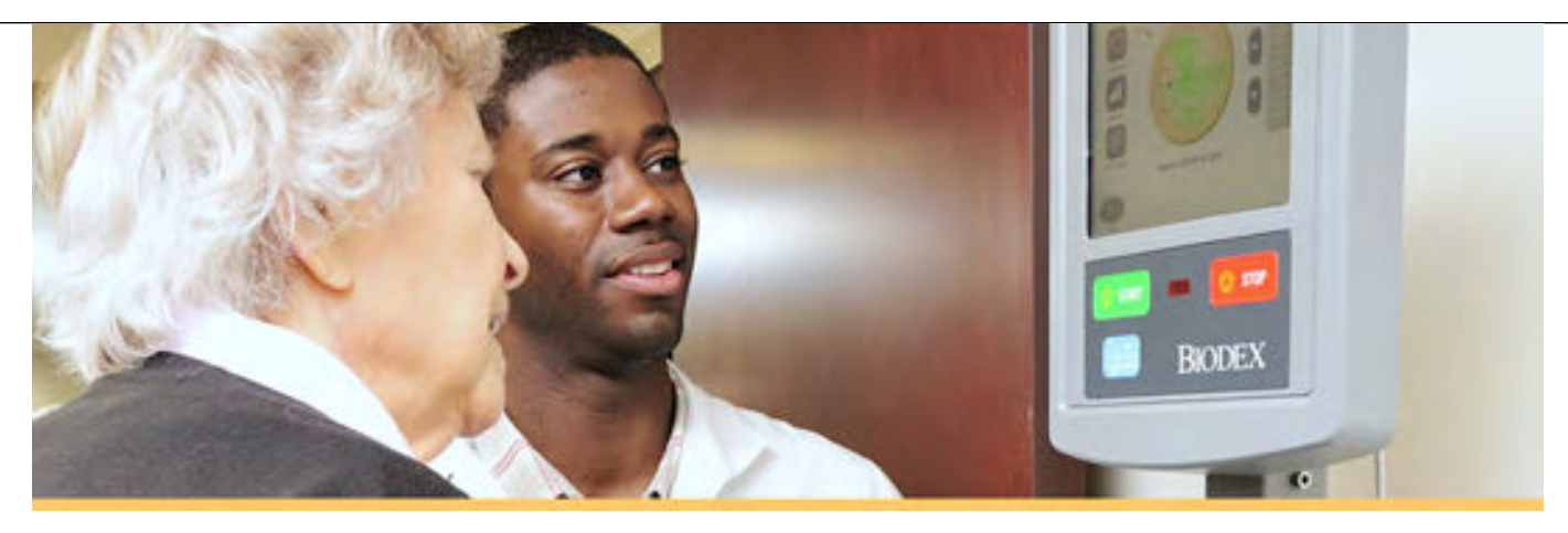
A UHS Pruitt therapist uses the visual feedback on the Balance System to help his client understand her abilities. Printouts are used to track progress toward a goal.