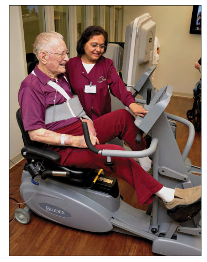
The Biodex BioStep is good for both endurance and lower extremity strengthening.

After hip or knee surgery, most surgeons want their patients to put as much weight on the operated limb as the patient can tolerate. The right kind of stress actually enhances bone healing. Without guided rehabilitation, many patients – perhaps, most – favor their un-operated leg. If they would walk like that for perhaps six to eight weeks until the pain subsided, they would develop bad gait patterns. Months later, such people are still displaying a short step length, which can increase their risk of a fall. And when they have to walk long distances, they're limping.