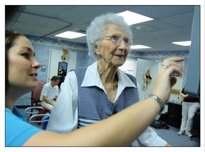
Regency Oaks provides state-of-the-art balance exercise and rehab to all its residents.

unconsciously – avoiding full weight bearing on the affected leg. The graphic display on the Biodex Balance System helps to persuade them it won't be painful to apply full weight bearing when they're not on the Balance System." Typically, patients with hip or knee implants spend between four and six weeks at Sylvan Center, the exact period depending in part on their ambulatory and cognitive status was prior to the surgery. "If they come in capable of